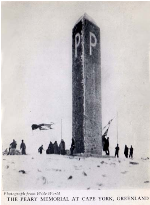
THE PEARY MEMORIAL AT CAPE YORK, GREENLAND